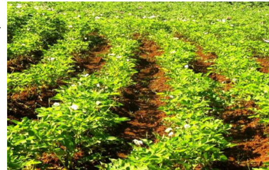
Our garden of potatoes...we plan to harvest by the end of August...